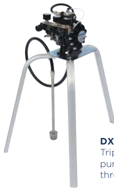
DX70R3-TF Tripod mounted pump outfit with three air controls.