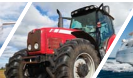
AGRICULTURAL AND OFF ROAD