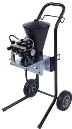
DX70R3-CFG Cart mounted pump with 1.4 gal (6L) gravity bucket feed, filter and three air controls.