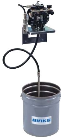
DX70R3-WF Wall mounted pump with paint filter and three air controls (Pail not included).