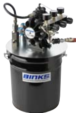
DX70R3-PFA Pail mounted pump with agitator, filter and three air controls (Pail not included).