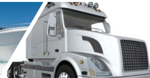
TRUCK AND BUS