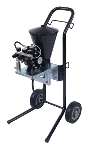
DX70R3-CFG Cart mounted pump with 1.4 gal (6L) gravity bucket feed, filter and three air controls.